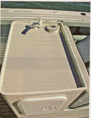
A raw water wash is provided on the centre bait and cutting table.