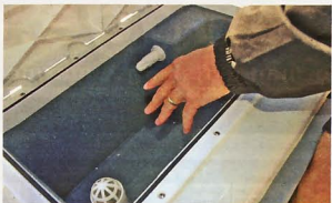
Left: One of the two plumbed live bait wells in the transom, which will hold at least six slimy mackerel each.

Just a touch more on the throttles eased the boat over the top of the chop and she just loved it right on the nose.