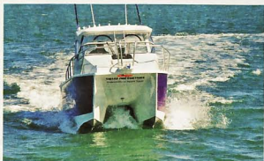
Right: The Sailfish 2400 Gamefisher is a big, safe, seaworthy offshore fisher with plenty of creature comforts and fishing features.

The huge hull cushioned out the bumps and even with my bad back, I chose to sit for the ride.