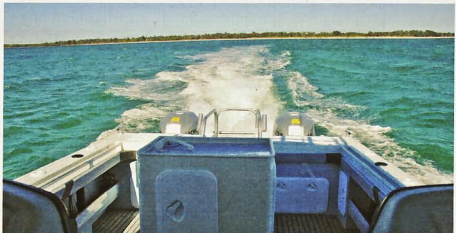
There's plenty of room in the cockpit, which has the large central bait station as a focal point.

Going out wide is not for everyone but for those who do it, it's very addictive and the Sailfish Gamefisher 2400 will be with you every inch of the way.