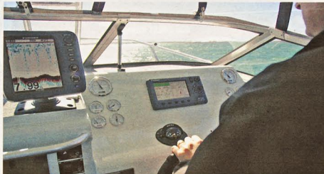
The Sailfish 2400 Gamefisher comes complete with wide-screen Furuno electronics.

especially when manoeuvring at the wharf.