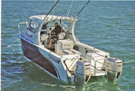
The twin Honda 135s provide excellent power and frugal fuel consumption.

Up forward there's a short bowsprit and a huge anchor well for holding a mile of warp. A smoked polycarbonate hatch throws light into the small, storage-only cuddy. Huge wrap-around split bow rails are great for holding onto,